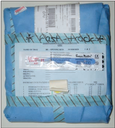
Figure 3. Small re sternotomy set packed with scalpel on top (above) and opened (below)